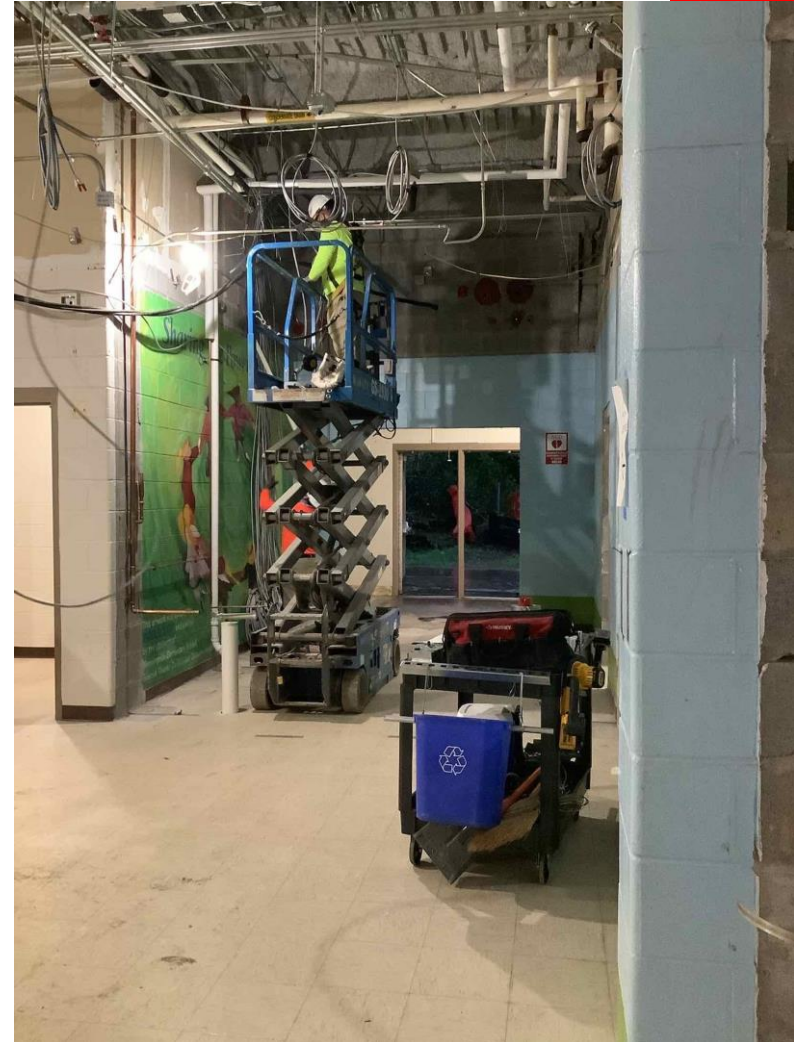
Plumbing overhead installation