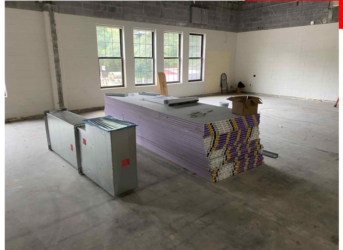
Drywall material delivery