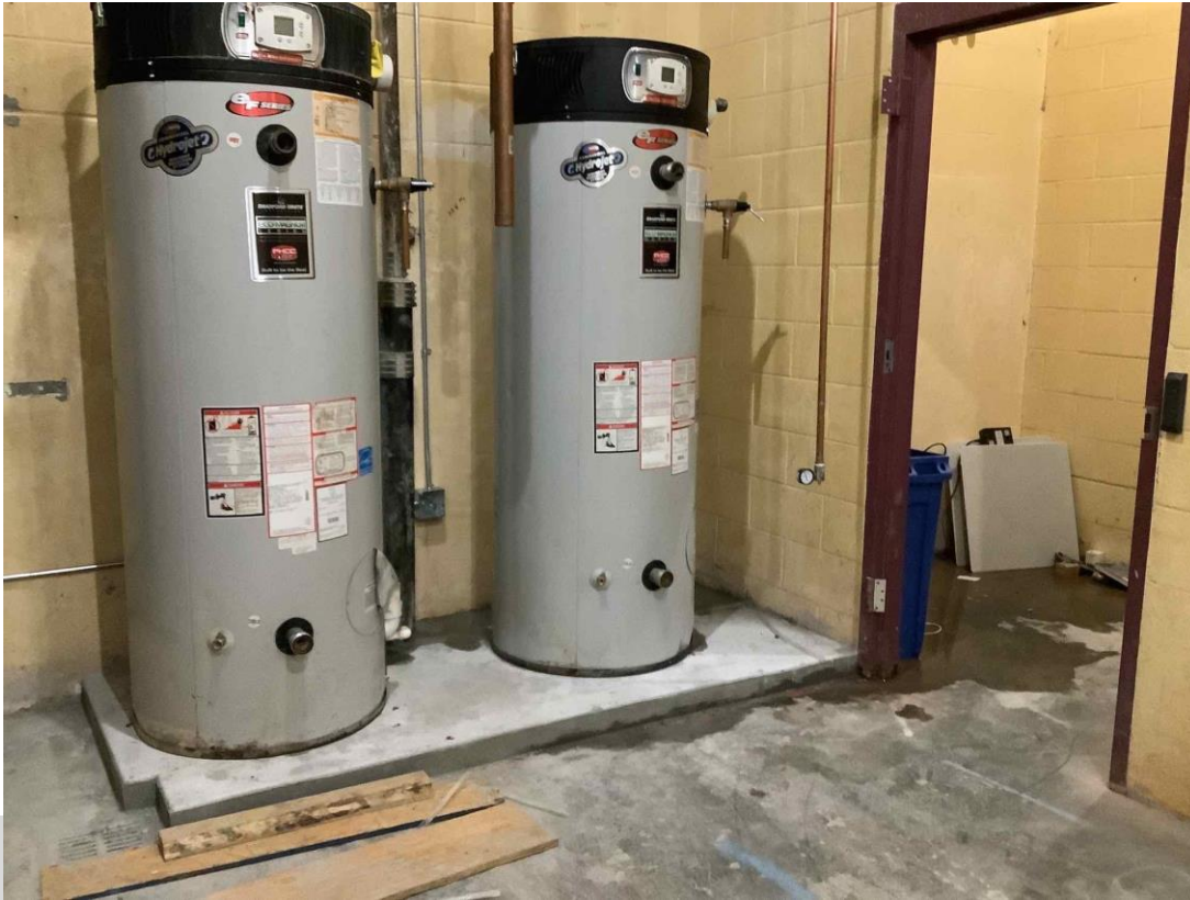
Water heater relocation