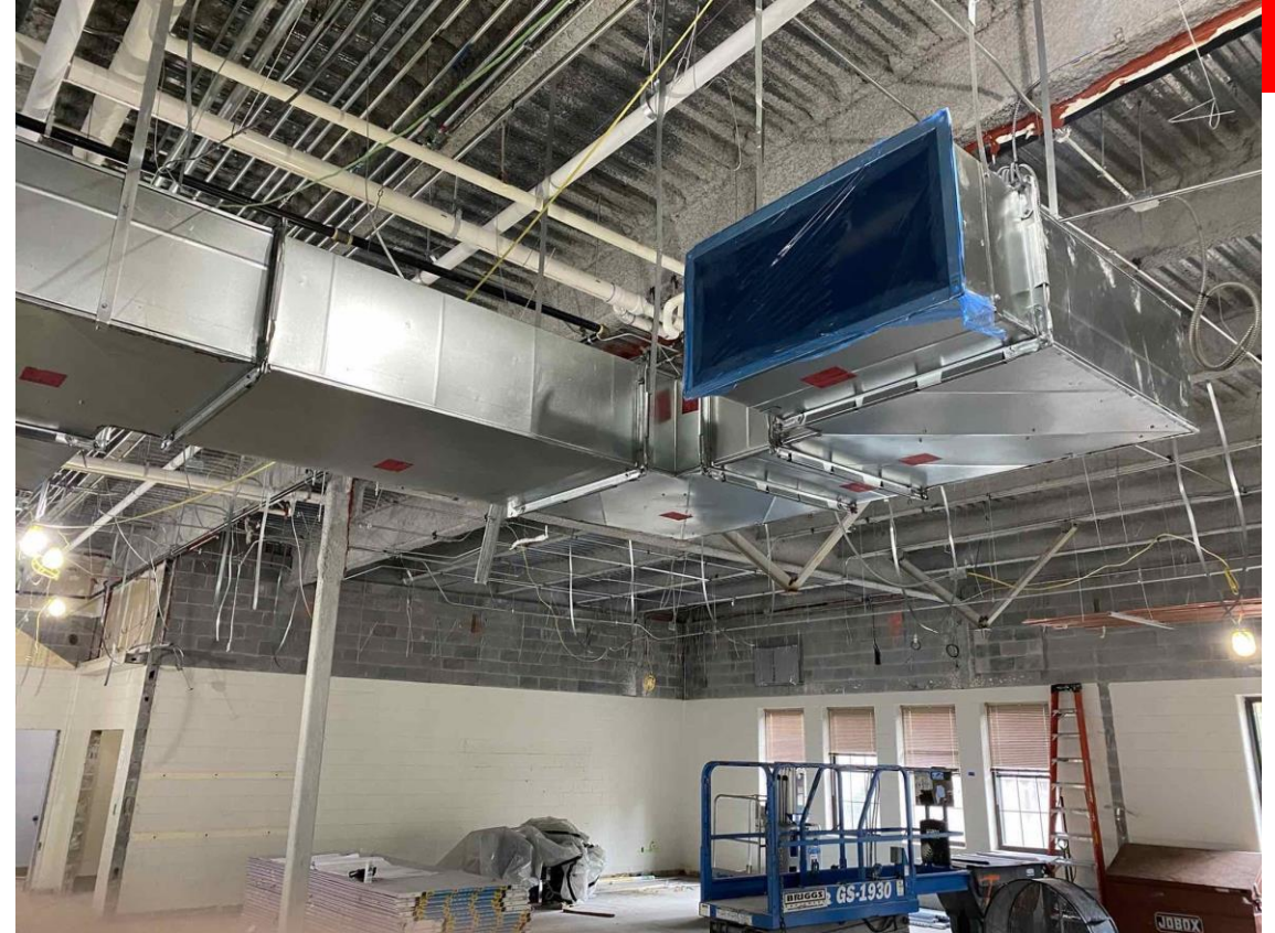
Duct installation in new kitchen