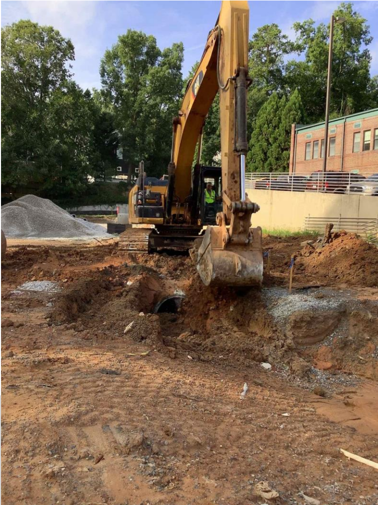
Existing storm drainage demolition